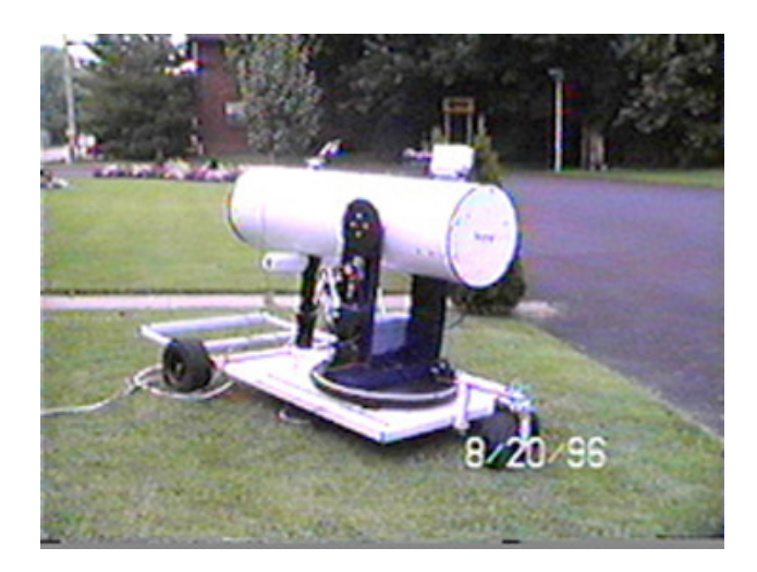
Figure 1 16" Newtonian telescope mounted on Scope Transport Unit.

At 7:26 local time (00:26 UTC<sup>6</sup>), several team members noticed that a bright object had suddenly appeared, and then disappeared, at a point below and to the right of the Moon (Figure 2). In the video, the object (designated ULO-092196) is seen initially for about a second, and then lost as the camera scans past it. Six seconds later, the object is reacquired and observed for another 13 seconds until the camera scans past it again. By the time the next scan occurred, the object was gone. The session was terminated at 10 PM that night as the weather began to deteriorate.