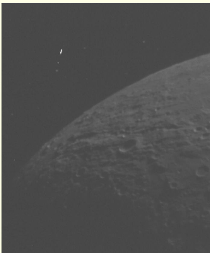
The Original Image

There are a couple of mysteries in this Clementine image. If you blow it up to 10 to 1 you will see a star like object below and under the "line of flight" of the streak and a fainter one behind. These star like objects do not appear in the following image 6 seconds later. So there are 3 anomolous objects in that image. UFOs don't travel in odd sized packs. Do they?